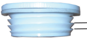
Pitch of Thread (Distance Between Threads)