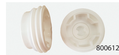
mauser thread gasket is at the bottom of the thread