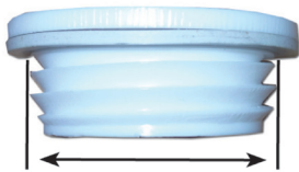
Outer Diameter of Thread

How to Measure a Thread e.g. Drum Bung or Adaptor